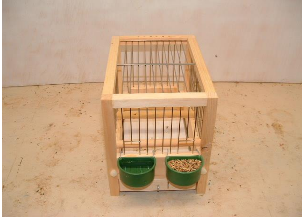
Correct water and feed placement on cages with identical cups.