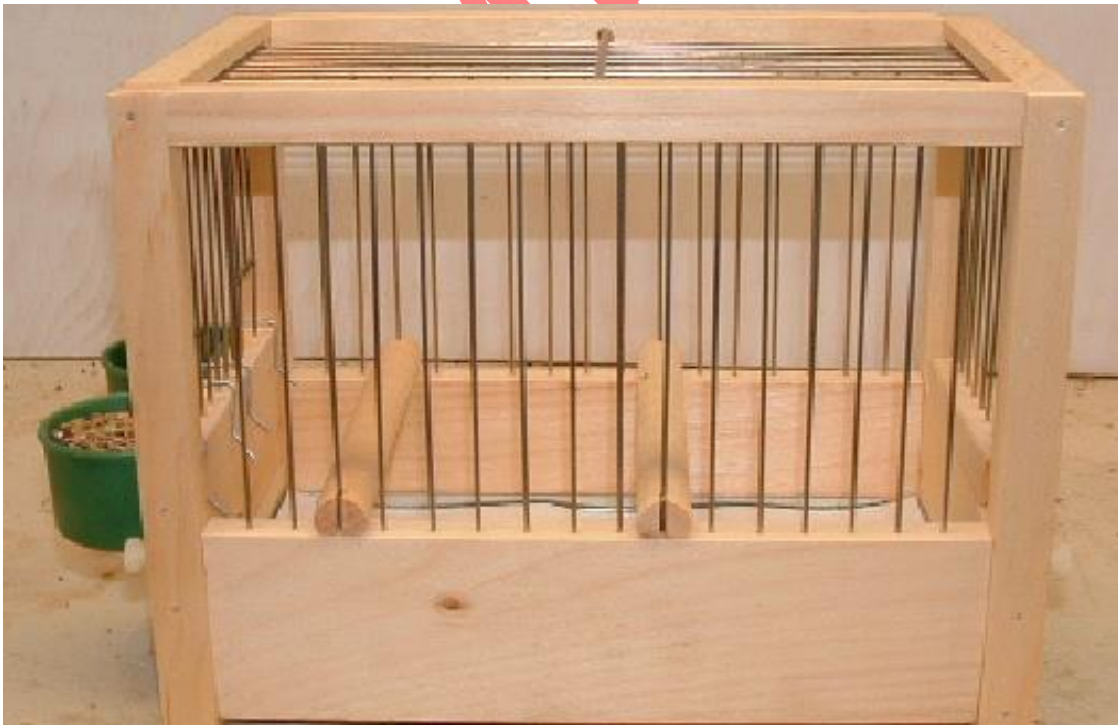
Correct perch placement on a waterslager style cage.